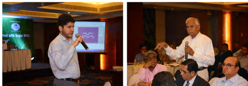
Top: Delegates during the seminar and Open House Session