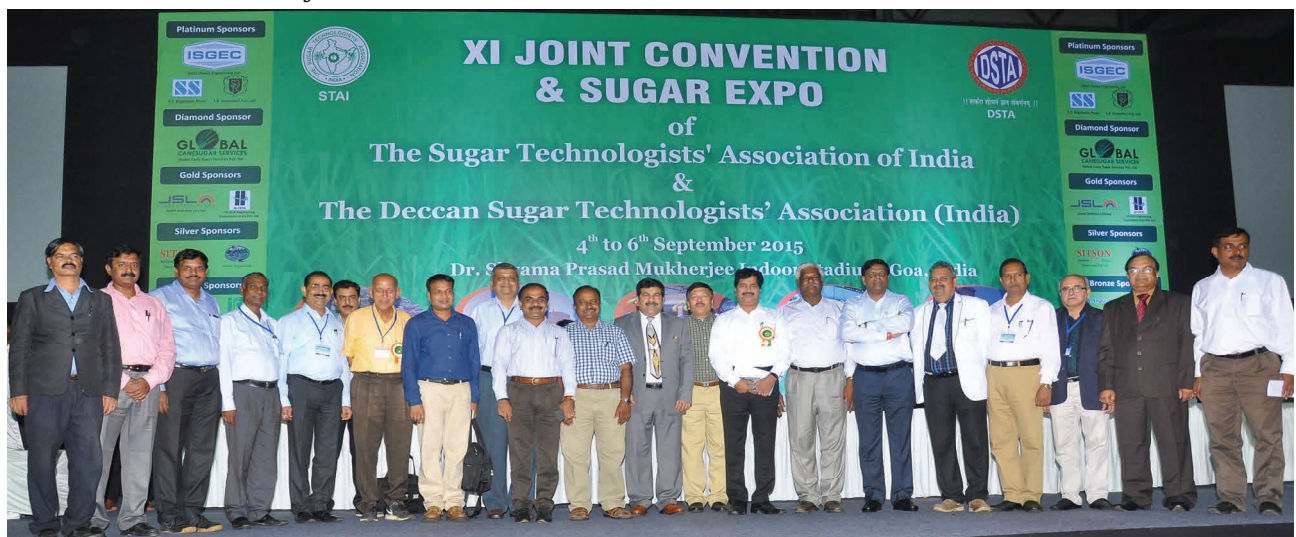
Group Photograph of New STAI Council