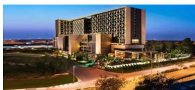
Panoramic View of Hotel The Leela Ambience Convention Hotel

The event would bring together nearly 900 national and international delegates at one platform.